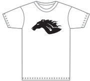
Design Only $18.00 + $7.50 (Set Up + Imprint)