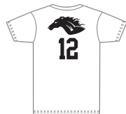
Design Doesn't Change but Number or Name Changes $18.00 + $9.00 + $7.50 (1 Set Up + 1 Repeat + 1 Imprint)