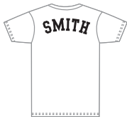
Name Only $18.00 + $7.50 (Set Up + Imprint)