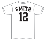
Name Changes and Number Changes $18.00 + $18.00 + $7.50 (2 Set Ups + 1 Imprint)

2" block letters and 8" collegiate numbers are standard.