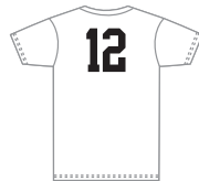
Number Only $18.00 + $7.50 (Set Up + Imprint)